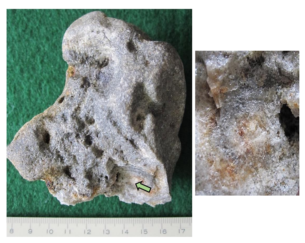
Figure 6 . Orthoquartzite nodule with fine to medium sand grain size as seen in a modern flake scar, nodule recovered in a gravel deposit along the Nottoway River in Sussex County, VA.