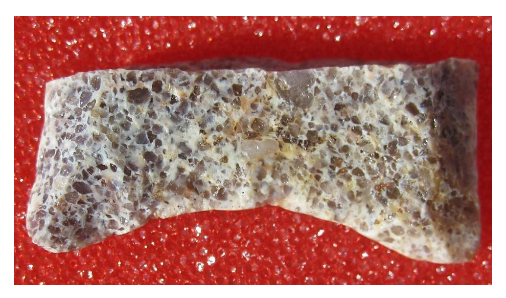
Figure 3 . Nanjemoy or Stafford County orthoquartzite Clovis artifacts composed of sand grains of fine to large size, and with a weathered matrix of blue-gray (top) or gray-white to white (bottom) from the Hanover County, Virginia Little Rocky Creek Clovis site (collected by J. P. McAvoy).