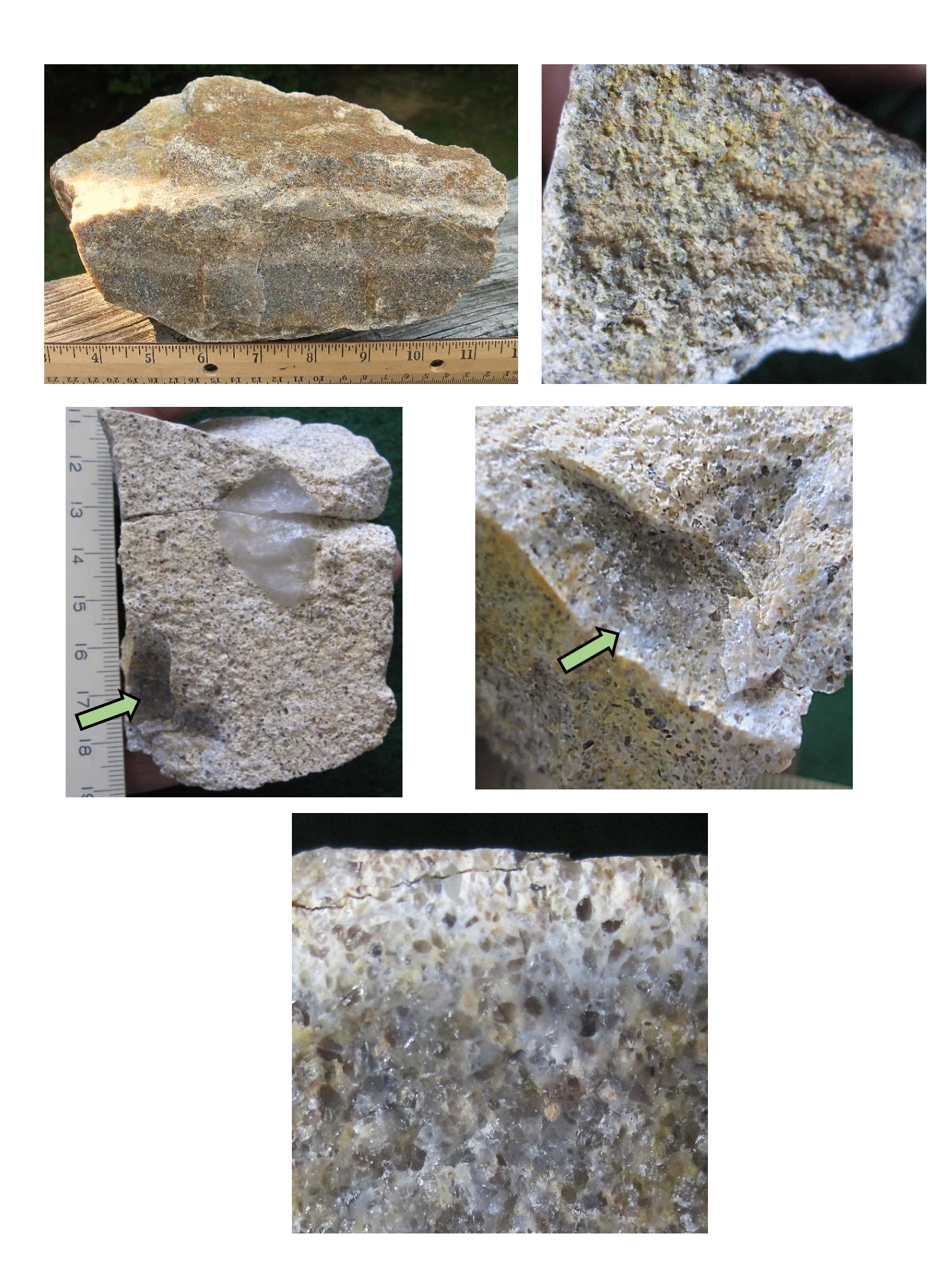
Figure 2 . Typical Nanjemoy or Stafford County orthoquartzite with fine to large sand grain size and lithic fragments, from Stafford County, Virginia along Potomac Creek.