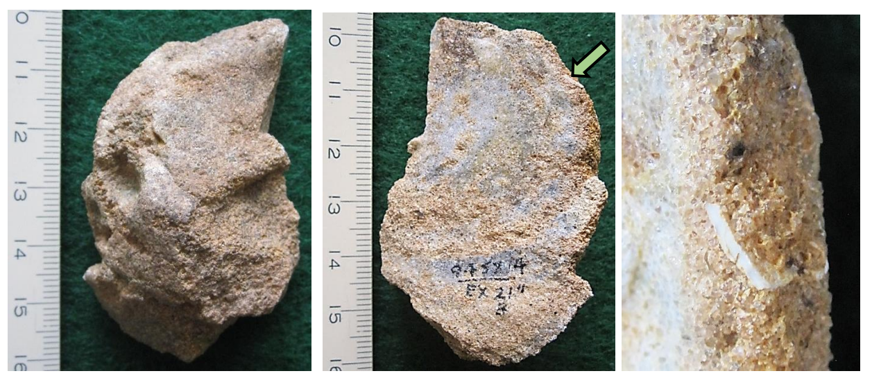
Figure 5 . Orthoquartzite cobble decortication flake with fine to medium sand grain size and fossil shell inclusions (right, magnified view of shell), W. T. Fannin site, Sussex County, VA.