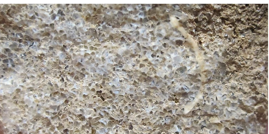
Figure 4 . Orthoquartzite Clovis side scrapers with fine to medium sand grain size and fossil shell inclusions (bottom, magnified view), Cactus Hill site, Sussex County, VA.