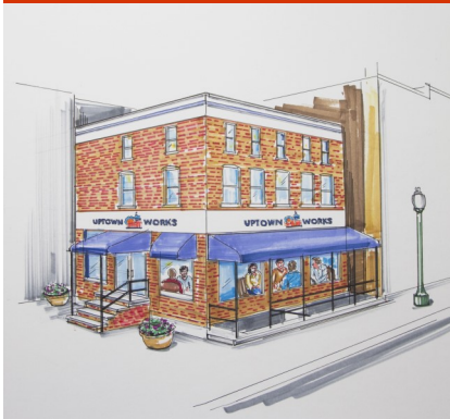
Future home of Uptown Works at 109 E. Main Street, next to Frank's Pizza

Uptown Works is conveniently located on "the diamond" in Somerset, with nearby food and parking.