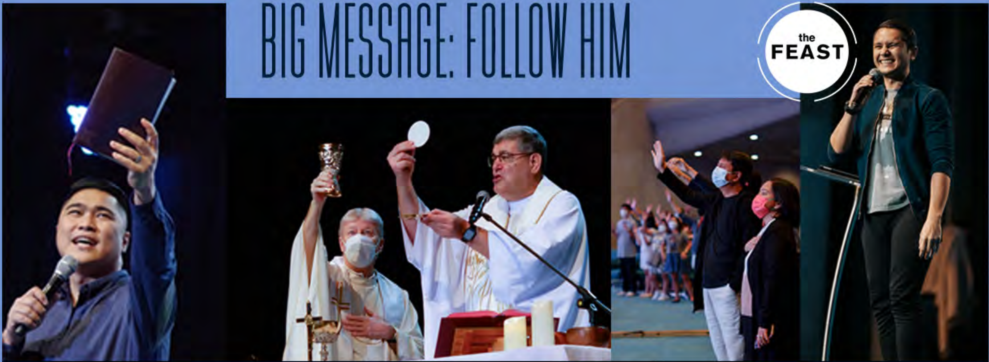
SCENES FROM LAST SUNDAY