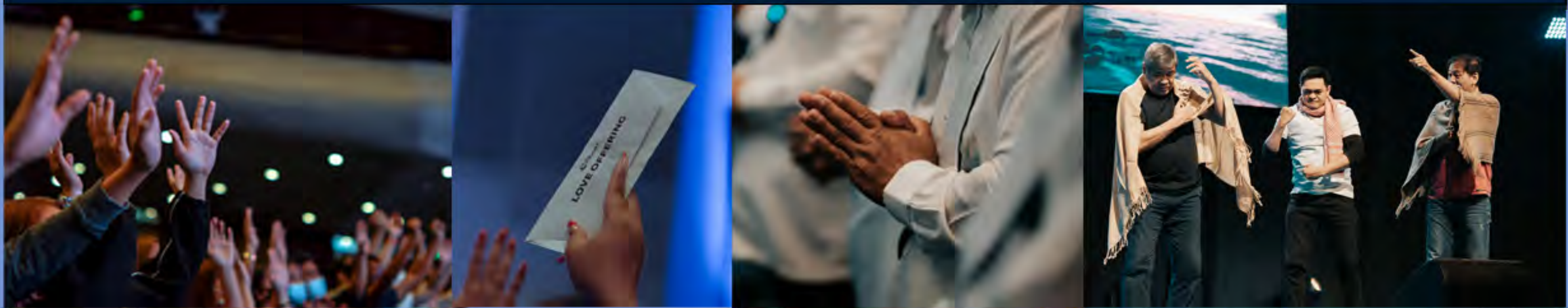
JESUS CALLS US TO "FOLLOW HIM AND BE FISHERS OF MEN".