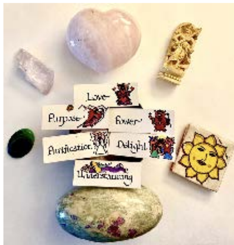
The Symbols surrounding the reading:

Rose Quartz – known as the “stone of unconditional love.” It helps process grief, reduce trauma and promotes, friendship and compassion, strengthens romantic bonds.