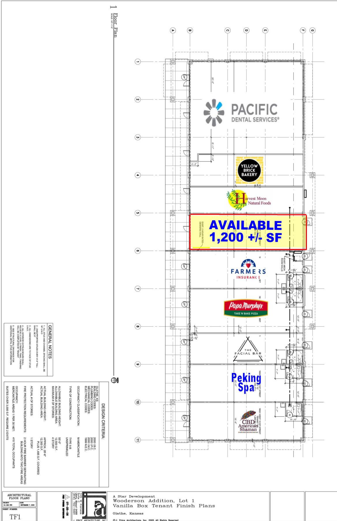
1 Floor Plan SCALE: 1/8" = 1'-0"

GENERAL NOTES: 1. ALL SHOP AND CHANNEL SIGNAGE SHALL BE 2" MINIMUM LETTER HEIGHT. 2. ALL DIMENSIONS ARE TO FACE UNLESS NOTED OTHERWISE. 3. ALL DIMENSIONS ARE TO FACE OF STUD. 4. ALL UTILITY CONNECTIONS SHALL BE MADE TO EXISTING UTILITY MAINS. 5. SEE ELECTRICAL DRAWINGS FOR ADDITIONAL UTILITY INFORMATION.