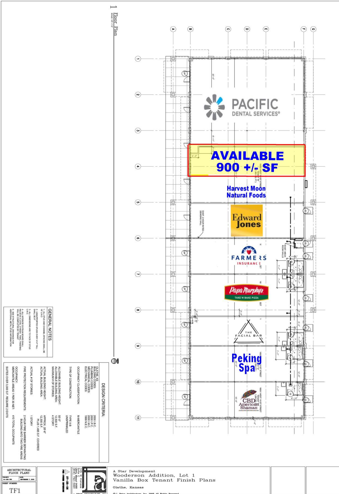
1 Floor Plan SCALE: 1/8" = 1'-0"

GENERAL NOTES 1. ALL FINISHES AND MATERIALS SHALL BE AS SHOWN ON THESE PLANS. 2. UNDEVELOPED STOPS OVER 4'-0" TALL SHALL BE 8" WIDE. 3. ALL DIMENSIONS ARE TO FACE UNLESS NOTED OTHERWISE. 4. ALL EXTERIOR DOOR AND WINDOW SILLINGS SHALL BE FINISHED WITH 1/2" THICK FINISHING PANELS. 5. SEE NOTES ON OTHER SHEETS FOR ADDITIONAL MATERIAL SCHEDULE INFORMATION.