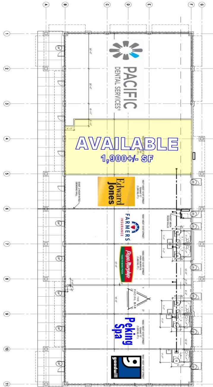
1 Floor Plan SCALE: 1/8" = 1'-0"

GENERAL NOTES 1. ALL TITLED AND CHANGER SPACING SHALL BE SHALL BE 1/8" 2. UNBARRICADED OPENINGS OVER 4'-0" SHALL BE 1/8" 3. ALL DIMENSIONS ARE TO FACE OF END WALL 4. ALL EXTERIOR FINISHES SHALL BE TO FACE OF EXTERIOR WALL 5. SEE STRUCTURAL DRAWINGS FOR ADDITIONAL DETAIL SPECIFICATIONS