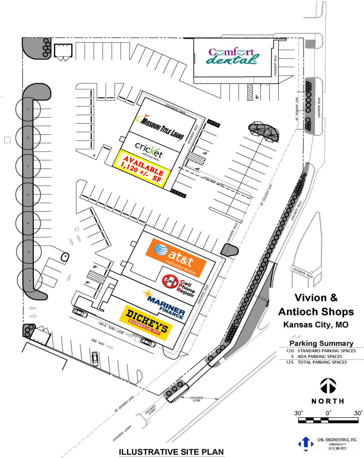
ILLUSTRATIVE SITE PLAN MAY 2015

UHL ENGINEERING, INC. KANSAS CITY (816) 385-2870