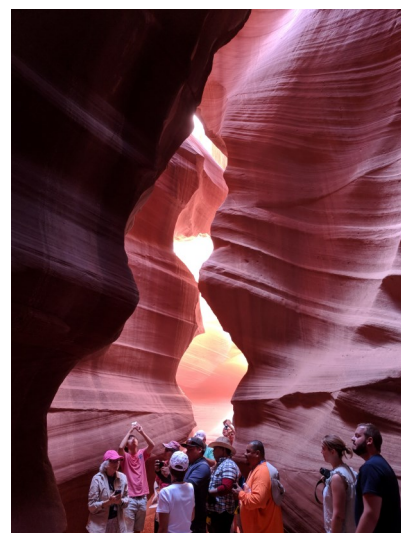
Antelope Slot Canyon, Page Arizona

* Please consider travel insurance for all travel * Direct flight seating is limited—please book early.