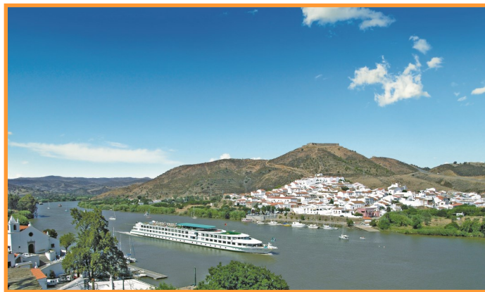
M/S La Belle de Cadix