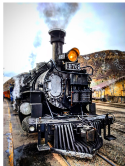
Durango & Silverton RR, Durango, CO

*Please consider travel insurance—call Rail & Sail!