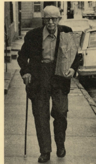
Returning home from shopping