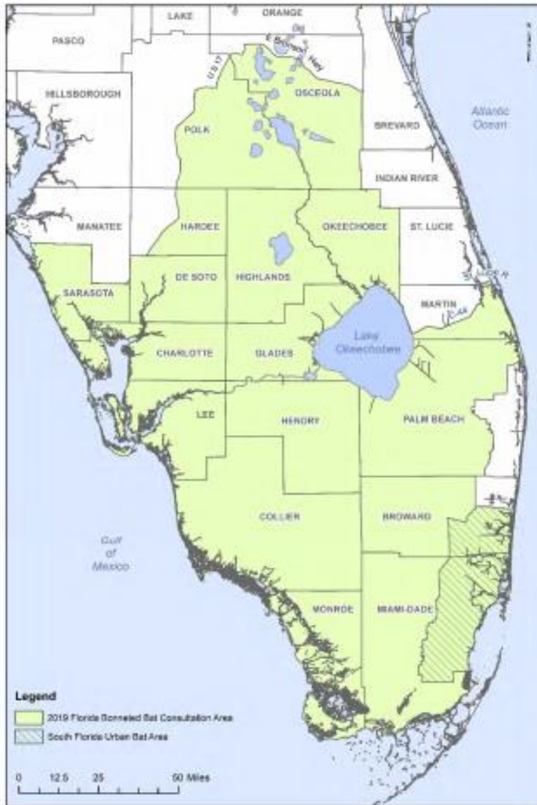
Figure 1. Florida Bonneted Bat Consultation Area. Hatched area (Figure 2) identifies the urban development boundary in Miami-Dade and Broward County. Applicants with projects in this area should contact the Service for specific guidance addressing this area and individual consultation. The Consultation Key should not be used for projects in this area.

2017 states “[w]idely scattered pine tree snags with potential bonneted bat cavities were observed.” The United States Fish and Wildlife Service provided the included Figure 1 showing the consultation area in 2019. 3