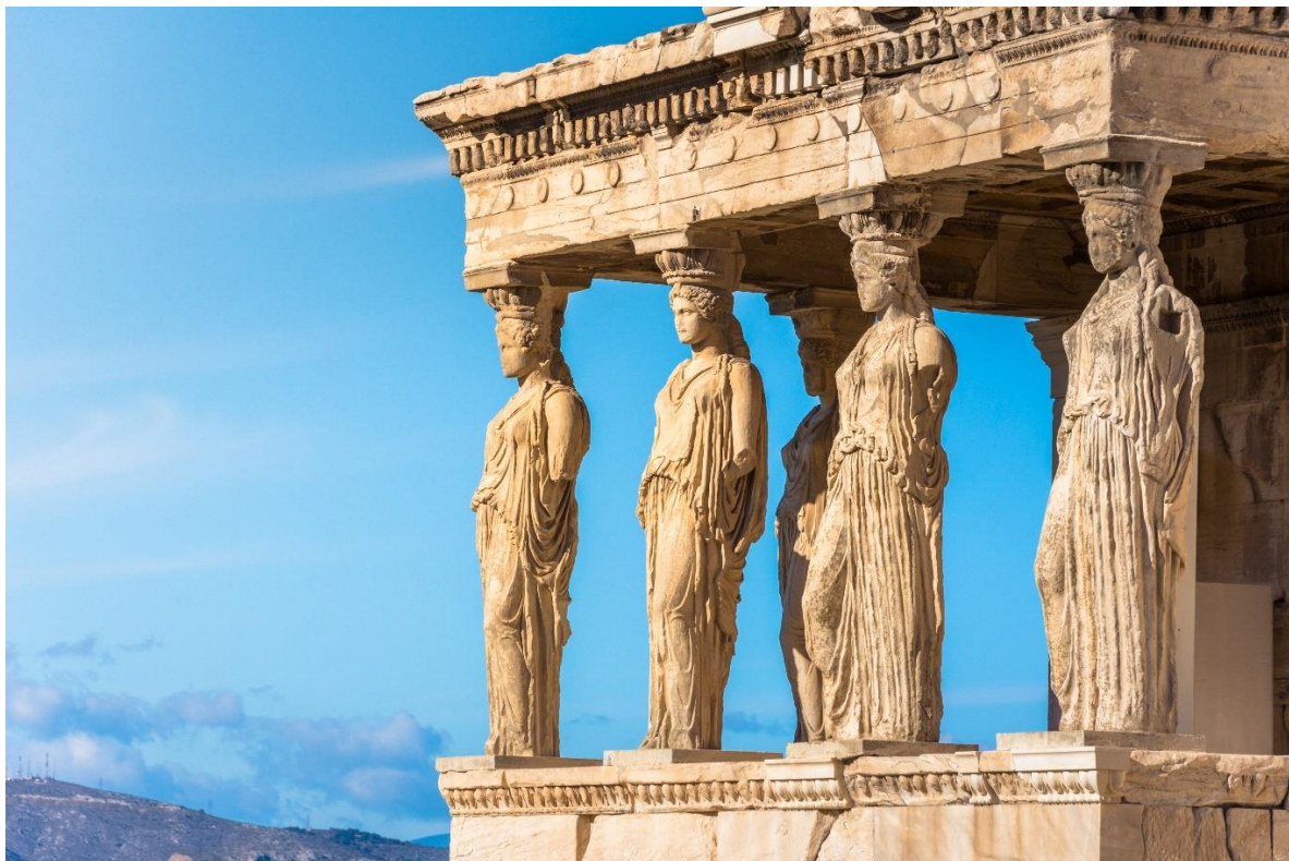
Karyatides statues, Eretheio, on the Acropolis in Athens, Greece.

"I thought it would be more interesting if I chose something which was out of my comfort zone to challenge myself...you have to push your limits and your boundaries"