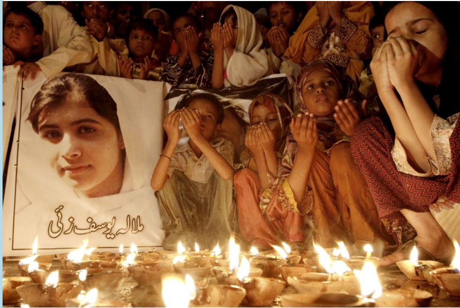
Pakistani children pray for 14-year-old Malala Yousufzai during a candlelight vigil in Karachi, Pakistan, Friday, Oct. 12, 2012.

That is the Eternal Sin and it is unforgivable.