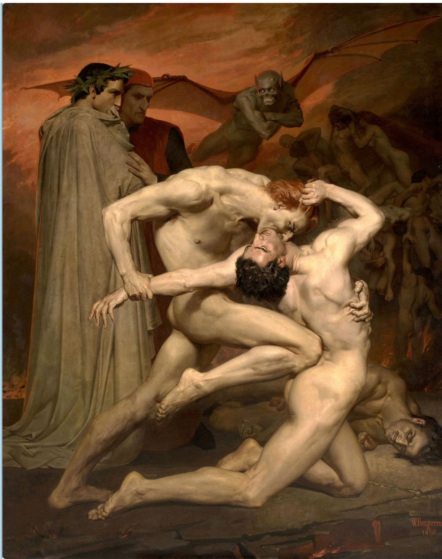
Dante and Virgil in Hell, an 1850 public domain image via the Google Art Project and Wikimedia Commons.

"Therefore I tell you, people will be forgiven for every sin and blasphemy, but blasphemy against the Spirit will not be forgiven. " Matthew 12:31 NRSV