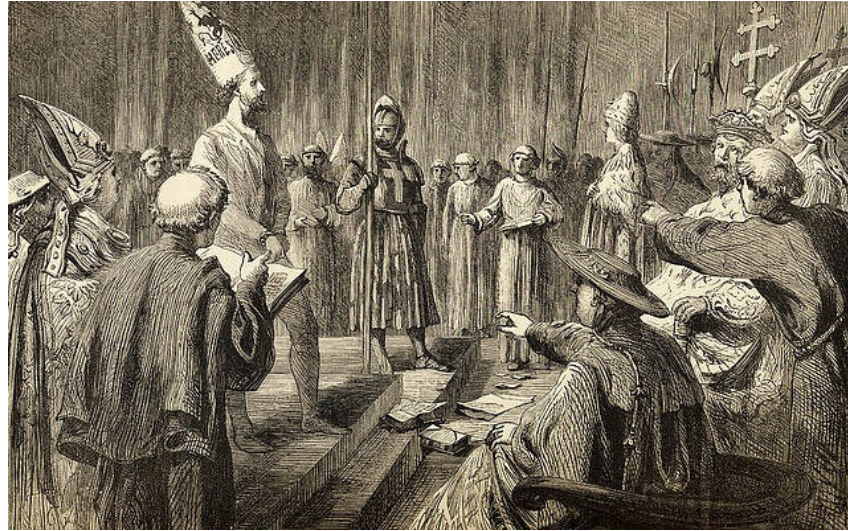
The Trial And Degradation Of John Huss In 1415. From The Book Of Martyrs By John Foxe, Published C.1865.

a word against the Son of Man will be forgiven; but whoever blasphemes against the Holy Spirit will not be forgiven. " Luke 12:10 NRSV