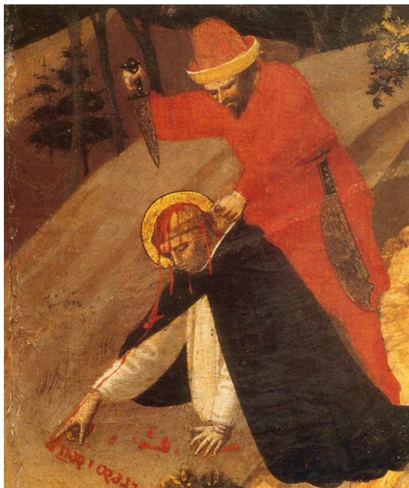
St. Peter Martyr Altarpiece [detail], Fra Angelico, 1428

The answers are found in the context of Jesus' reprimand. Christ uttered this warning just after he had been accused by some Pharisees of casting out demons by the power of Satan (Matthew 12:22-24). Jesus responded by pointing out that He cast out demons by the power of God's Holy Spirit (Matthew 12:25-28). This made the Pharisees guilty of giving credit to Satan for the work of the Holy Spirit. This is the blasphemy Jesus is talking about.