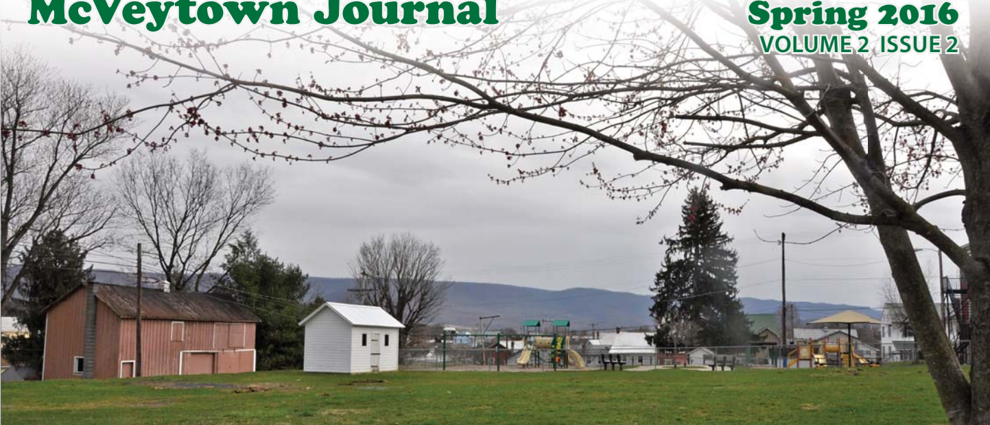
McVeytown is greening up!