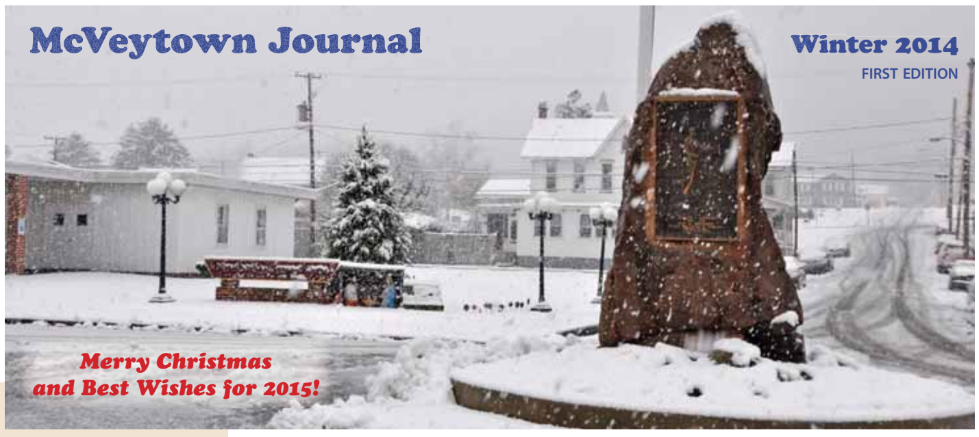
Town Council Members