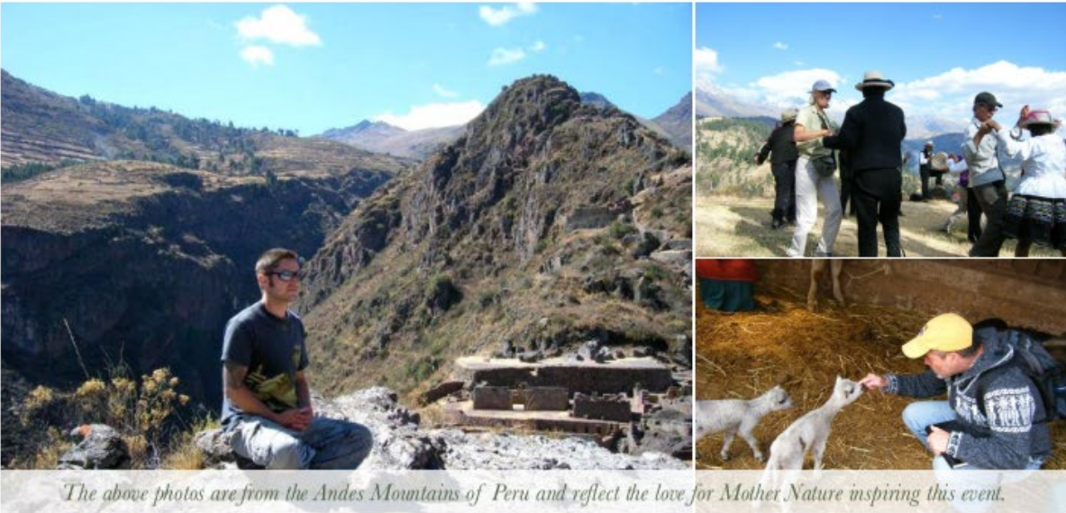
The above photos are from the Andes Mountains of Peru and reflect the love for Mother Nature inspiring this event.