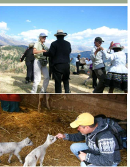
The above photos are from the Andes Mountains of Peru and reflect the love for Mother Nature inspiring this event.