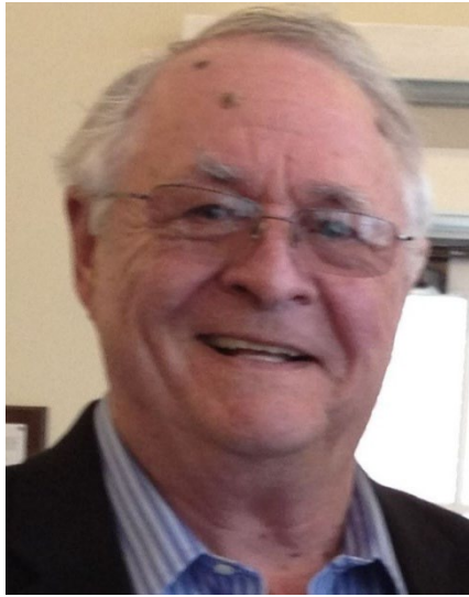
From the clerk