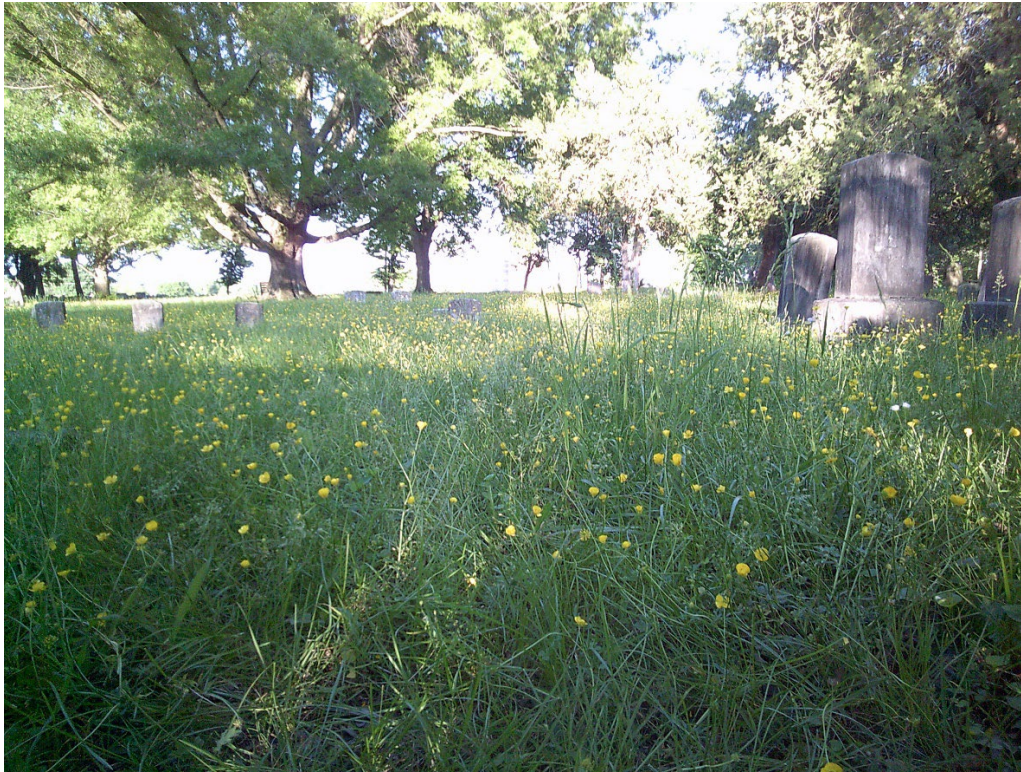
Buttercups in Hopewell Graveyard