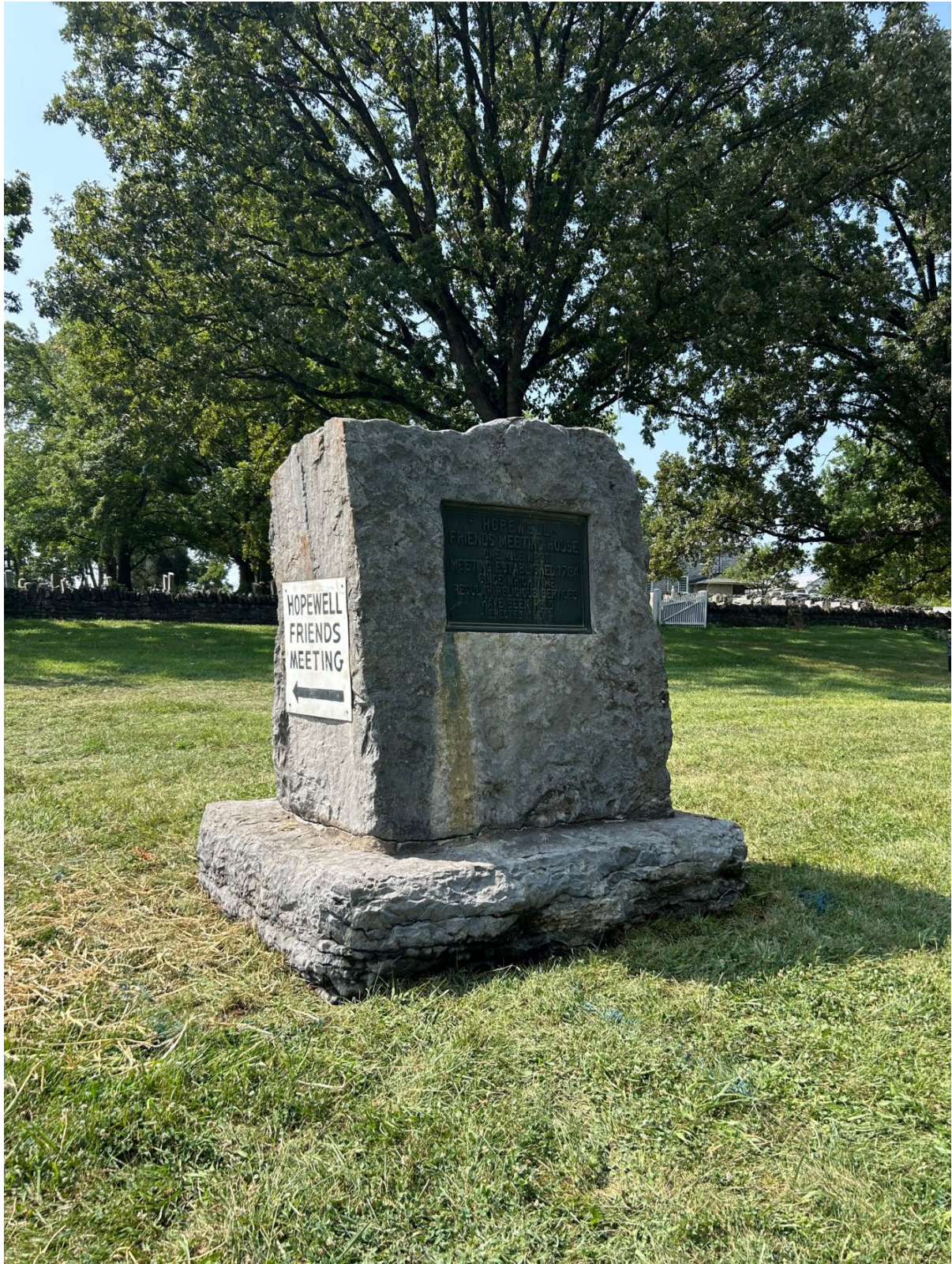
Pictures of Moving Day, Submitted by Pam Hambach, Hopewell Centre Meeting