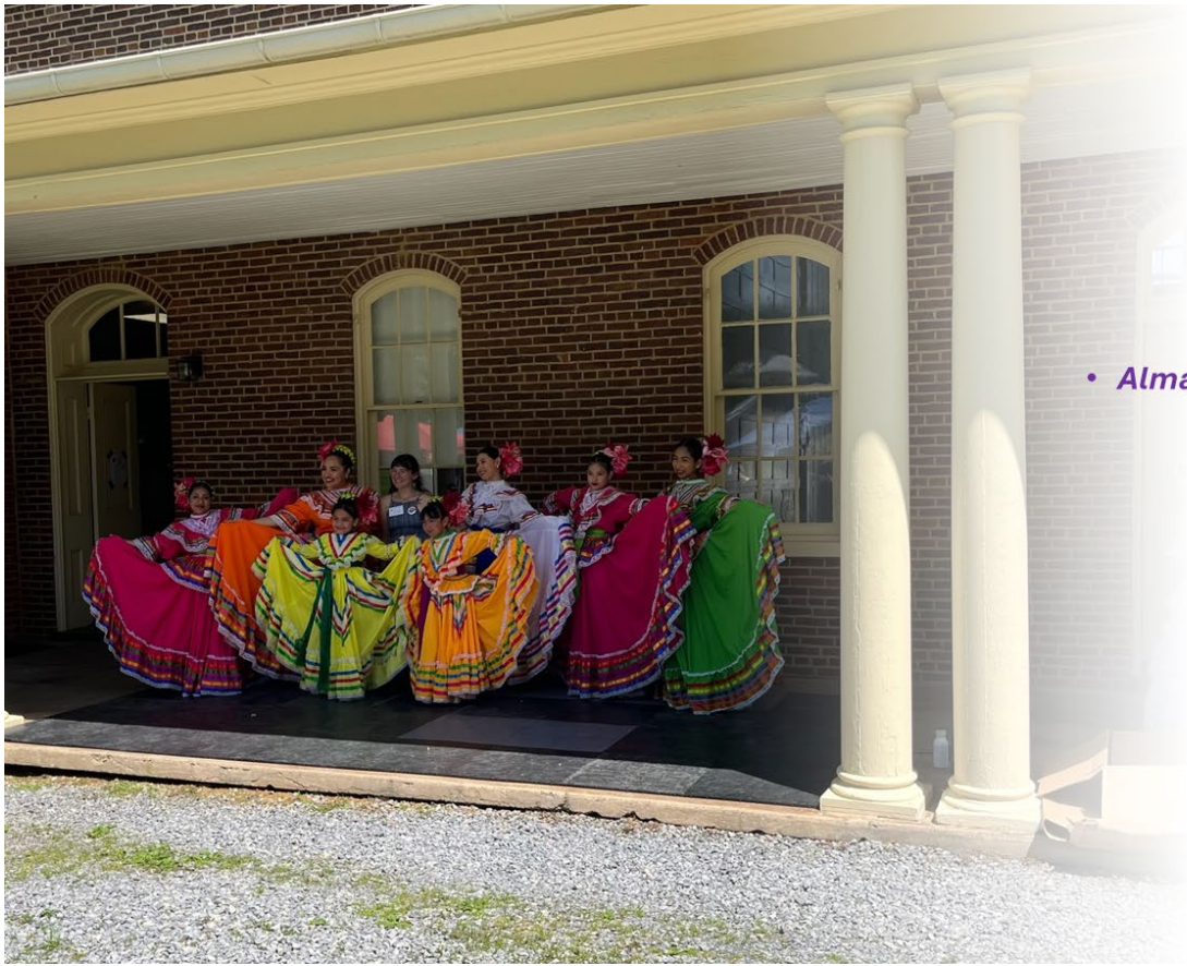
• Alma y Folklore Dance Troupe