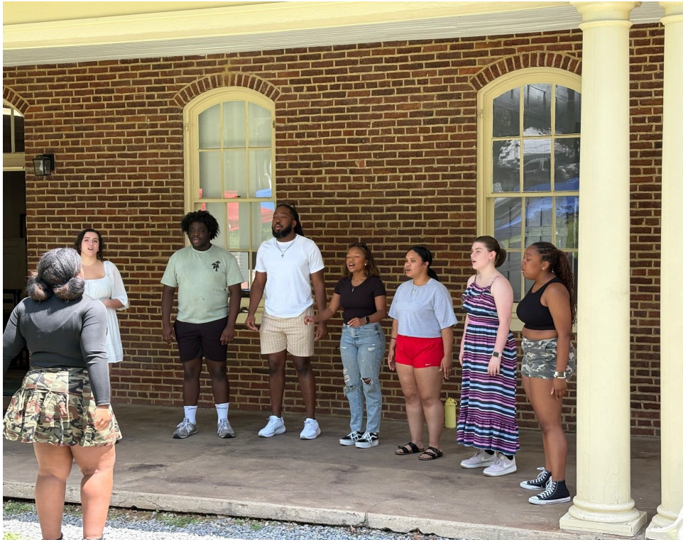
• Harambee Gospel Choir