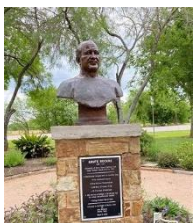
Bust of Knute Rockne, Coach at Notre Dame University

Discover how the town of Rockne was named.