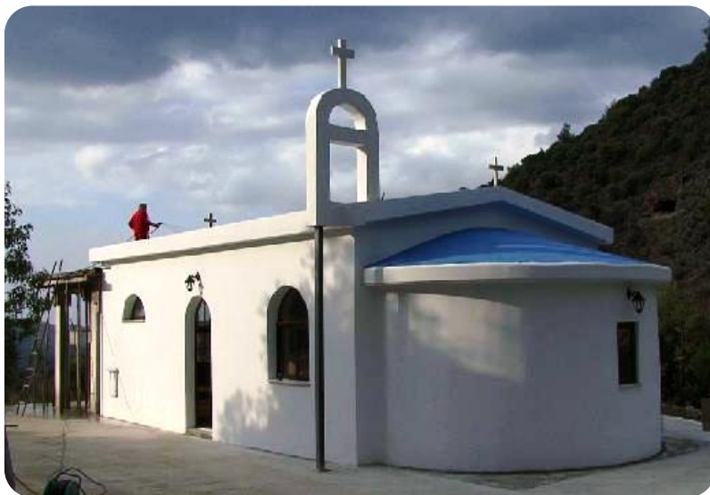
Saint Sozon Church, Cyprus