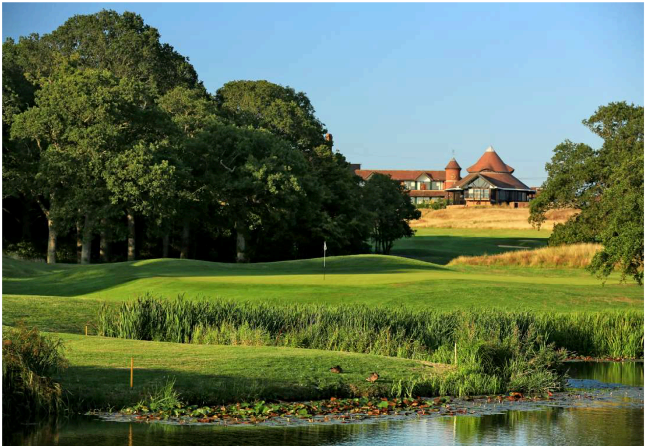
East course – Par 4, 17 th hole

Well bunkered greens and fairways on the front nine lull you into a false sense of security for the challenging back nine which contains arguably one of the best stretch of finishing holes in golf.