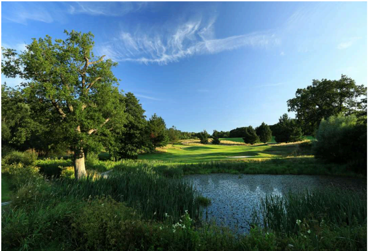
West course – Par 3, 13 th hole

The West boasts no fewer than four signature holes. The 12th is a demanding par five without out of bounds either side of the drive, followed by a difficult second shot with water on the right and trees on the left, culminating in a plateau green guarded by a severe pot bunker and water around half the perimeter of the green. Standing on the 16th tee looking at the par three green, no more than 100 yards away, looks easy. Beware! The 17th is another demanding par five. The 18th, in the opinion of many is one of the most underrated finishing holes you could find. From the tee an accurate drive is essential on to a tree-lined fairway, followed by a shot into a heavily guarded green with the backdrop of the magnificent Clubhouse beyond.