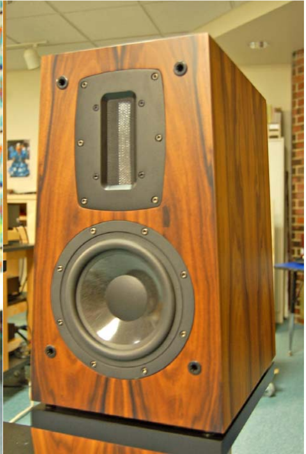
Eficion Ficion F200 2-way loudspeakers retail for $2500.00 per pair not including stands.

MHI Evidence Loudspeakers have a real piano black finish and retail for $650.00 per pair, the sand filled and modified Epos stands are $400.00 per pair.