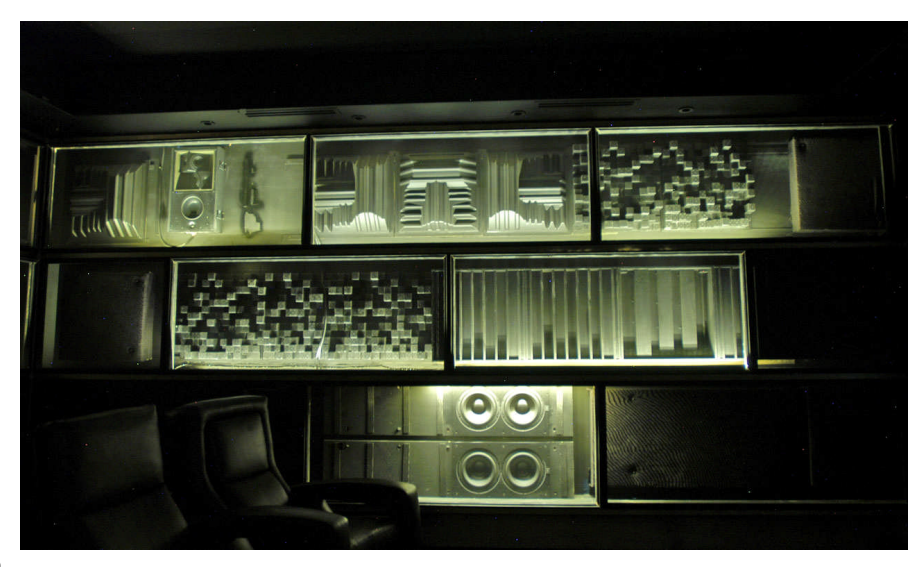
Back lighting reveals serious acoustic treatments behind the acoustically transparent fabric on the side walls of the large home theater.

The evening was a lot of fun. There were several new faces at the meeting and some of those joined the club that evening. I was able to talk to many members and not stray far from the grazing table. This certainly was a meeting to remember.