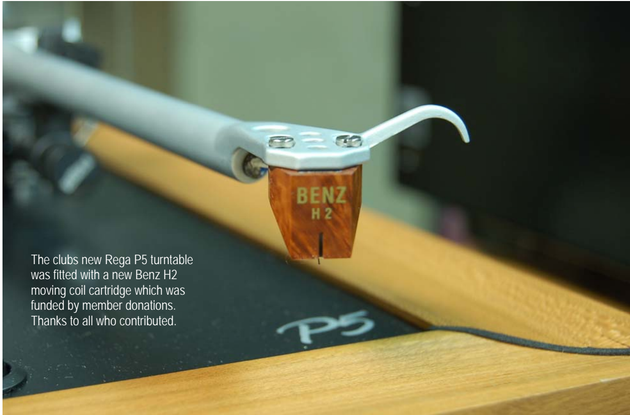
The club's new Rega P5 turntable was fitted with a new Benz H2 moving coil cartridge which was funded by member donations. Thanks to all who contributed.