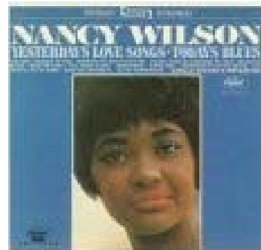
Nancy Wilson - Yesterday's Love Songs, Today's Blues - (1967) ST 2012

Interesting. She can definitely sing and perform, but in her own very individual style. She’s backed here by Mulgrew Miller on piano, Lonnie Plaxico on bass, and Terri Lynn Carrington on drums. I’ve never heard Mulgrew Miller sound better or more creative. Like a pitcher in a tie game in the ninth, two outs, bases loaded, 3/2 count, he throws a curve ball. Wow. Taking big chances like Cassandra Wilson does here, putting her own twist on standards. But if you’re good at what you do, you can get away with it, refreshingly.