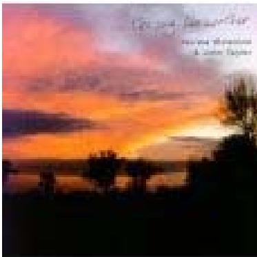
Norma Winstone - Like Song Like Weather - (1999) - Koch 7875

After her recording days slimmed down, she hosted the hour-long jazz show on NPR in the 90's, which honored a famous jazz musician each week. It was excellent just like she is. One of the truly great members of our jazz community.