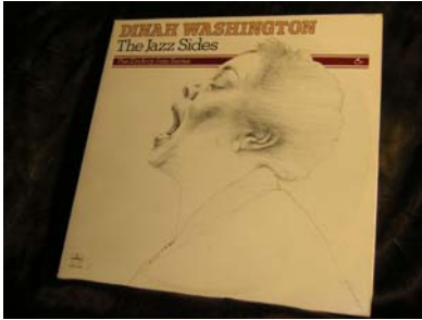
Dinah Washington - The Jazz Sides - (1954 – 1958) - Emarcy 824-883

Dinah Washington was one of the all time greatest jazz singers. Growing up in Chicago, she gained her musical experience in a church choir, and in 1939 won an amateur contest and was “discovered”. In less than four years she was singing with Lionel Hampton’s band, and gaining the opportunity for her first recording which would bring her some recognition. She stayed with Hamp from 1943 to 1946, after which she struck out on her own, performing and recording with all of the top jazzmen of the day. By 1958 she appeared as one of the headliners of the Newport Jazz Festival.