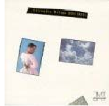
Cassandra Wilson - Blue Skies - (1988) - JMT 834 419

I really like her singing. She has an easy, comfortable style on ballads. Her rendition of “A Nightingale Sang in Berkeley Square” is worth more than the price of the CD.