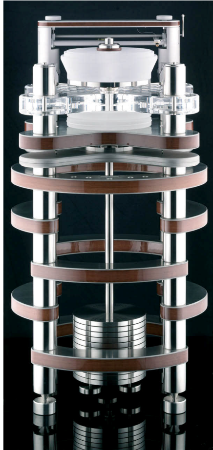
Clearaudio's Statement Turntable $170,000 + Goldfinger Statement phono cartridge $15,000

Without a doubt, the Clearaudio Statement was the star of the show. Besides being a beautiful-sounding turntable, this piece is really a work of