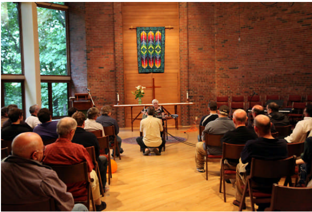
Set-up in the Sanctuary.