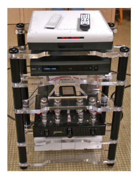
Playback Design DAC (top shelf) used to playback DSD files.

tion, Bruce can explain and demonstrate how the recordings can be improved by reducing noise, etc.