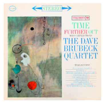
The Dave Brubeck Quartet Time Further Out Columbia CS8490 original issue (1961)