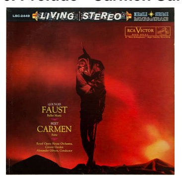
Alexander Gibson/Royal Opera House Orchestra RCA LSC-2449 Classic Records Re-issue (1997) also 45RPM Clarity one-sided