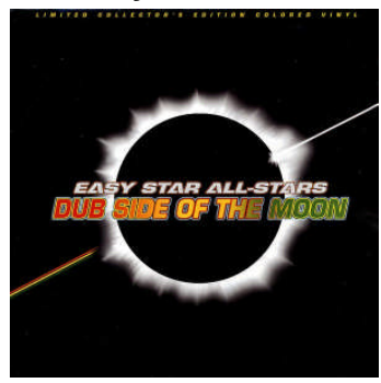
Easy Star All-Stars Dub Side of the Moon Limited Edition, Green Vinyl Easy Star Records ES-1012V (2003)