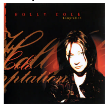
Holly Cole Temptation Blue Note JP5003 Classic Records Re-issue 33-1/3 RPM version (1995)