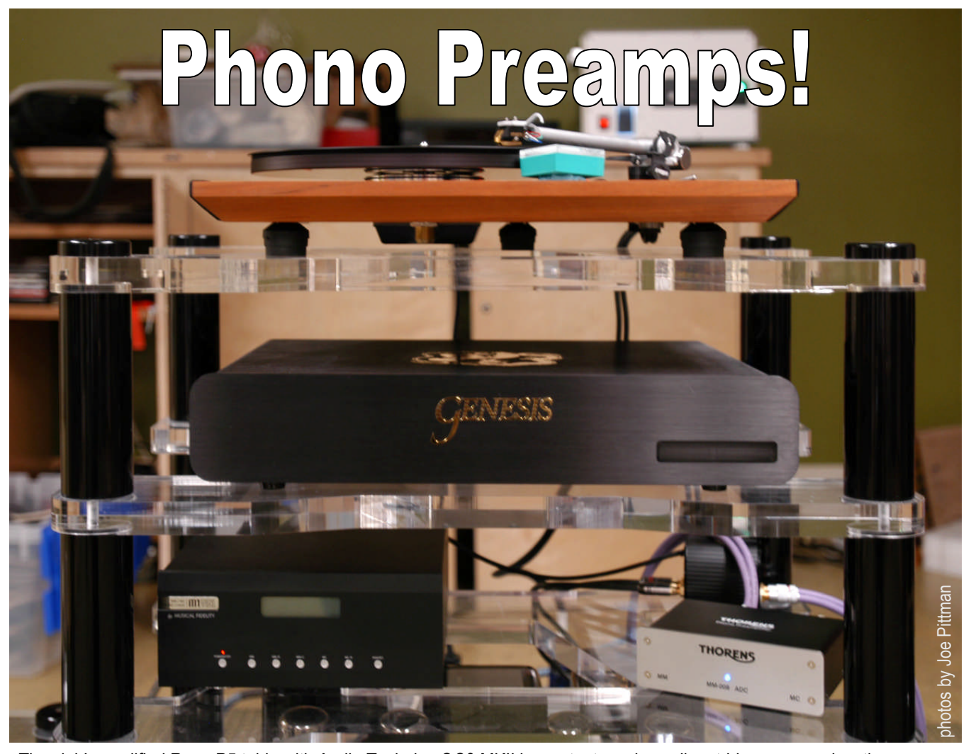
The club's modified Rega P5 table with Audio Technica OC9 MKII low output moving coil cartridge was used as the source.