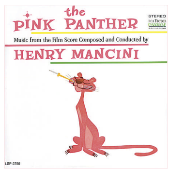
Henry Mancini/The Pink Panther Sony Legacy Records Re-issue on Pink Vinyl for Record Store Day 2014 to celebrate Mancini's 90th birthday & 50th Anniversary of the original release & mastered from the original analog tapes. Limited Edition No 135 of 6000