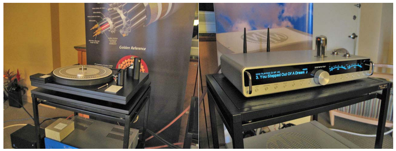
Well Tempered Turntable, MSRP $2300