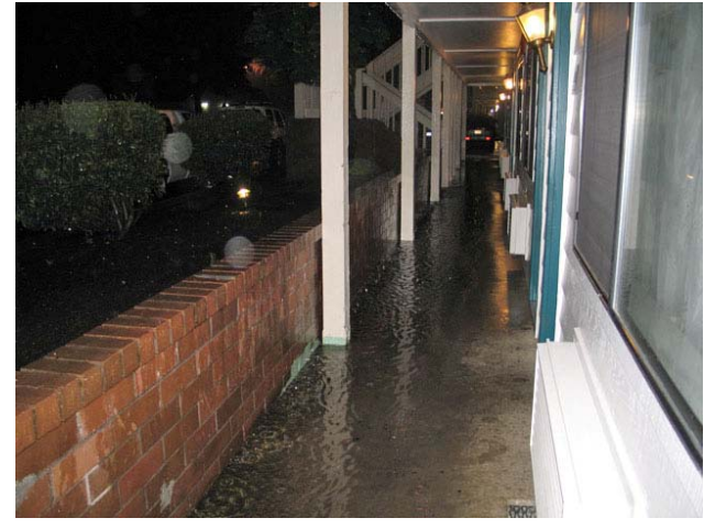
Motel 6 with flowing river (no additional charge).

http://www.6moons.com/ industryfeatures/vsac20082/ vsac.html http://www.head-case.org/meetimpressions/vsac-2008-impressions/