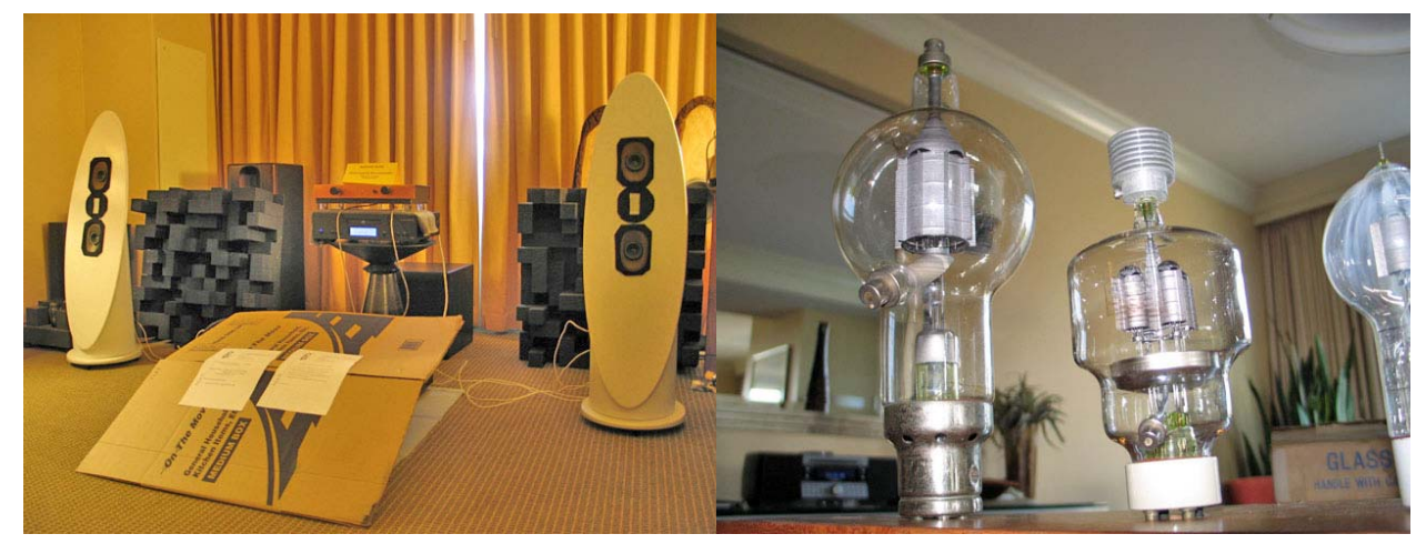
Audio Improvements, these guys Tweak