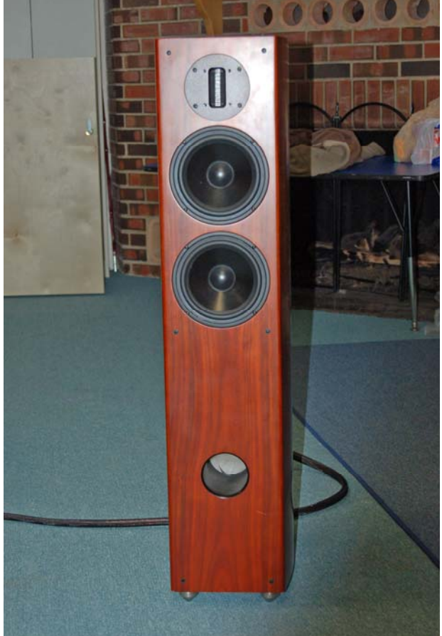
LSA 2 Statement speakers with ribbon tweeter.