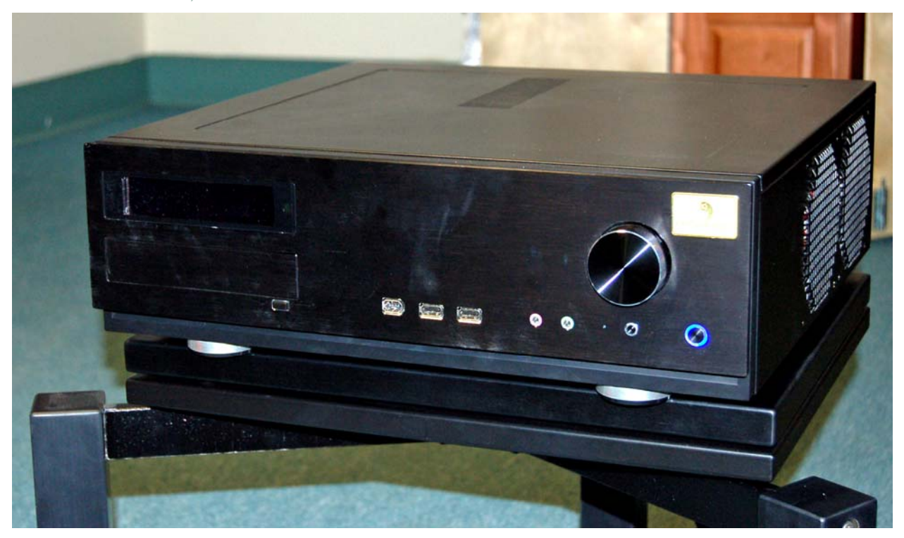
eXemplar's preproduction Music Server unfortunately took a tumble and couldn't be demonstrated. It was a pity as this unit is outstanding. You're all encouraged to go hear this at Tucker's place to discover that servers are producing SOTA sound.

eXemplar's new XP-2 preamplifier on top shelf and XD-2 DAC on middle shelf (with older cosmetics, new production cosmetics will be similar to the XP-2)