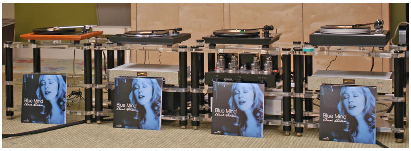
From L-R, Club's Rega P5, Thorens TD 170-1 entry level automatic, Thorens mid level TD 295 MK IV, and Thorens classic suspended chassis TD 350.

In order for club members to hear the differences between the turntables, they were each placed on identical KOSMIC equipment stands. And two Burmester Ph100 Reference-line Phono Stages ($24,000 each) with two separate and configurable phono inputs each (MM and MC) allowed level-matching and optimization (impedance loading and capacitance) for each of the four different cartridges used. The club's Genesis