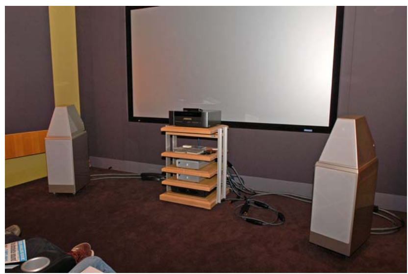
Transparent Audio demonstrated their new cables series.