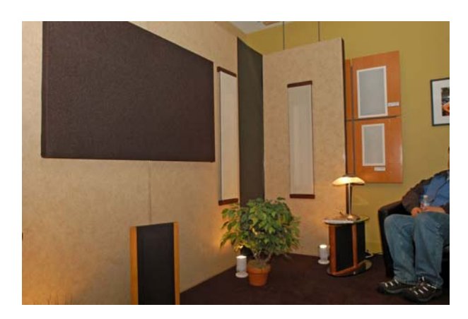
Magnapan's new wall mounted speakers and subwoofers utilize there planar magnetic dipolar panel technology.