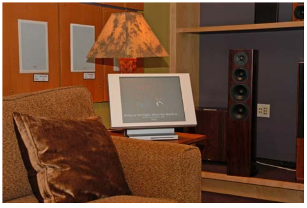
Sooloos music server system