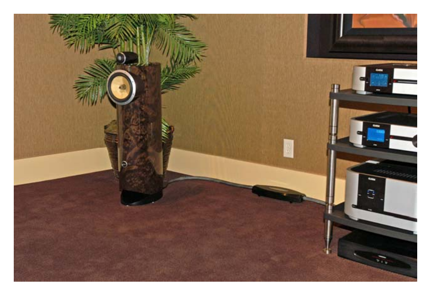
B&W demonstrated their new Signature speaker.