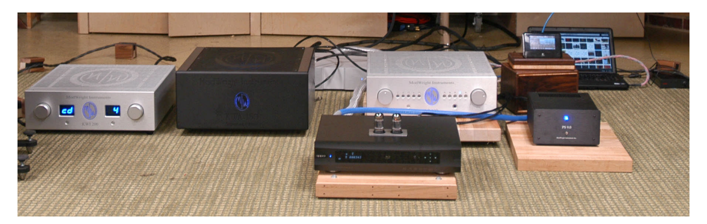
Sharing the stage was the ModWright 150SE amp, LS100 preamp with onboard DAC, and tube-modified Oppo BDP-95. The new KWI200 Integrated amp was on static display for most of the evening, but was briefly played at the very end of the meeting. Note: ModWright is offering a 15% discount to all club members in good standing, who wish to obtain a tube-modified Oppo BDP-95 and mention that they heard it at the February meeting. Please contact ModWright directly for further details.