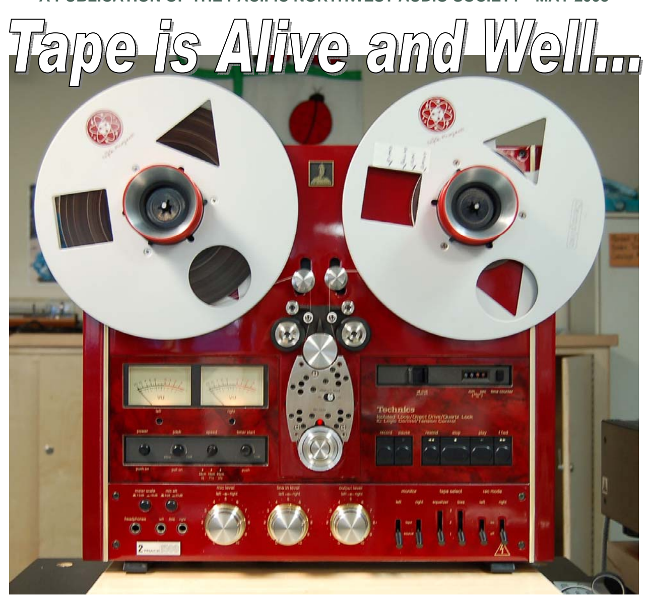
APRIL 10th MEETING RECAP

A PUBLICATION OF THE PACIFIC NORTHWEST AUDIO SOCIETY • MAY 2008