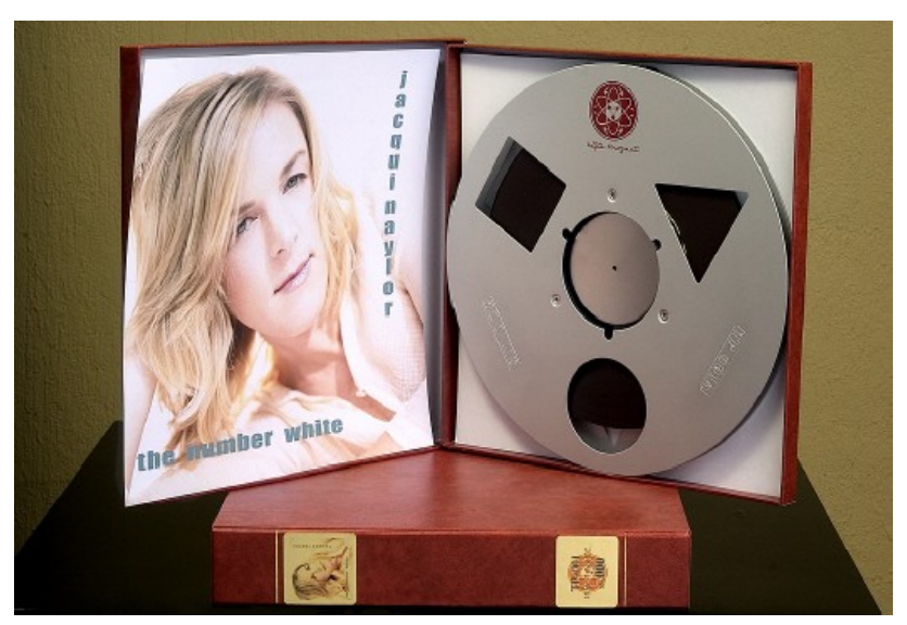
Tape 001 Jaqui Naylor

Tape in the mastering business is used as an "effect". There are hundreds of tape emulation boxes and plug-ins for software. Some are junk, some are pretty close and some are damn good. The "effect" we use tape for is the tape head saturation that we scriptions are $1200 and include 6 get when levels get too high. Pretty much like the effect today with the loudness wars, when levels get too high, we get digital clipping. Tape saturation is like digital clipping, but more pleasing to the ear. Drums recorded on tape have a "fat/euphoric" sound. I use the tape effect on digital recordings that sound too harsh and have been recorded "in-the-box". If I want to fatten up the bottom end of a recording, I might run it through a tape machine.