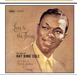
When I Fall In Love by Nat King Cole from Love Is the Thing