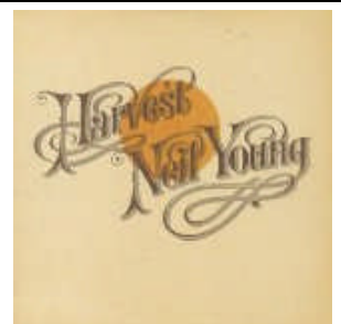
Old Man by Neil Young from Harvest