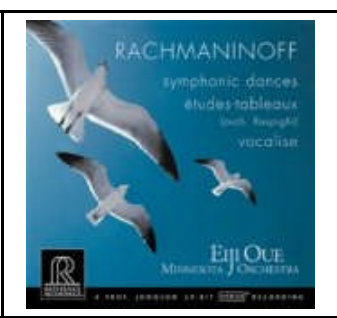
Symphonic Dances by Rachmaninoff