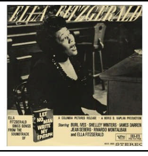
One For My Baby by Ella Fitzgerald from Let No Man Write My Epitaph