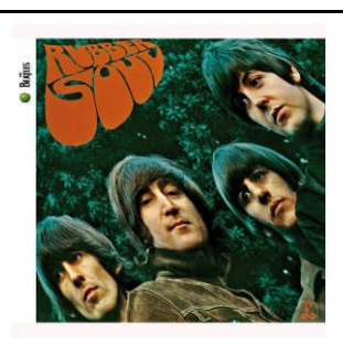
Norwegian Wood by The Beatles from Rubber Soul