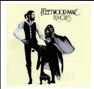
Never Going Back Again by Fleetwood Mac from Rumours