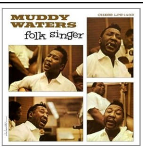
Little School Girl by Muddy Waters from Folk Singer