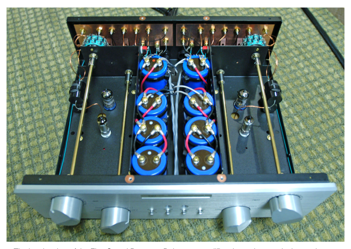
The interior view of the First Sound Presence Deluxe preamplifier shows the true dual mono layout, stepped attenuator volume controls and the massive capacitor storage.

One advantage of working with a smaller boutique audio company like First Sound is that Emmanuel can work with you individually to customize your unit with a number of features and options he offers, from different types of wiring, grounding schemes, component types, etc. One of the more surprising demonstrations of the evening was when Emmanuel showed off the inputs in his unit that utilized different types of wire; the difference in sound was more dramatic than most of us were expecting and it seems a great way to tailor your sound and synergy with the components you're connecting. Emmanuel brought two preamps, the