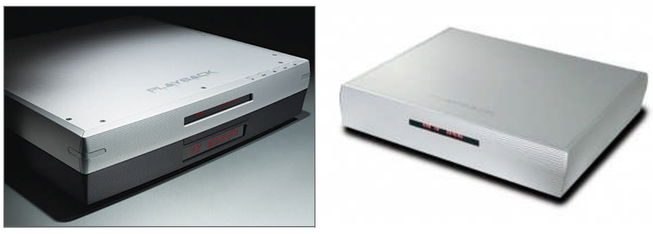
Playback Designs MPS-5