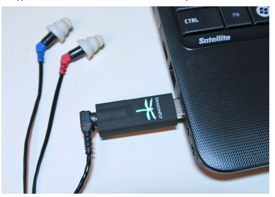
DragonFly with Etymotic ER-4 In-ear headphones and Genesis Gen6 laptop.

I'm using my <u>Genesis Gen6 laptop</u> with optimized software, running J <u>River Media Center 17</u> ($49.98) for playback and <u>JRemote</u> for remote control of JRMC via my iPad (available at the Apple App Store for $9.99). And for steaming music to JRMC from network attached storage, I highly recommend the <u>Lacie 2Big 6TB NAS</u>.