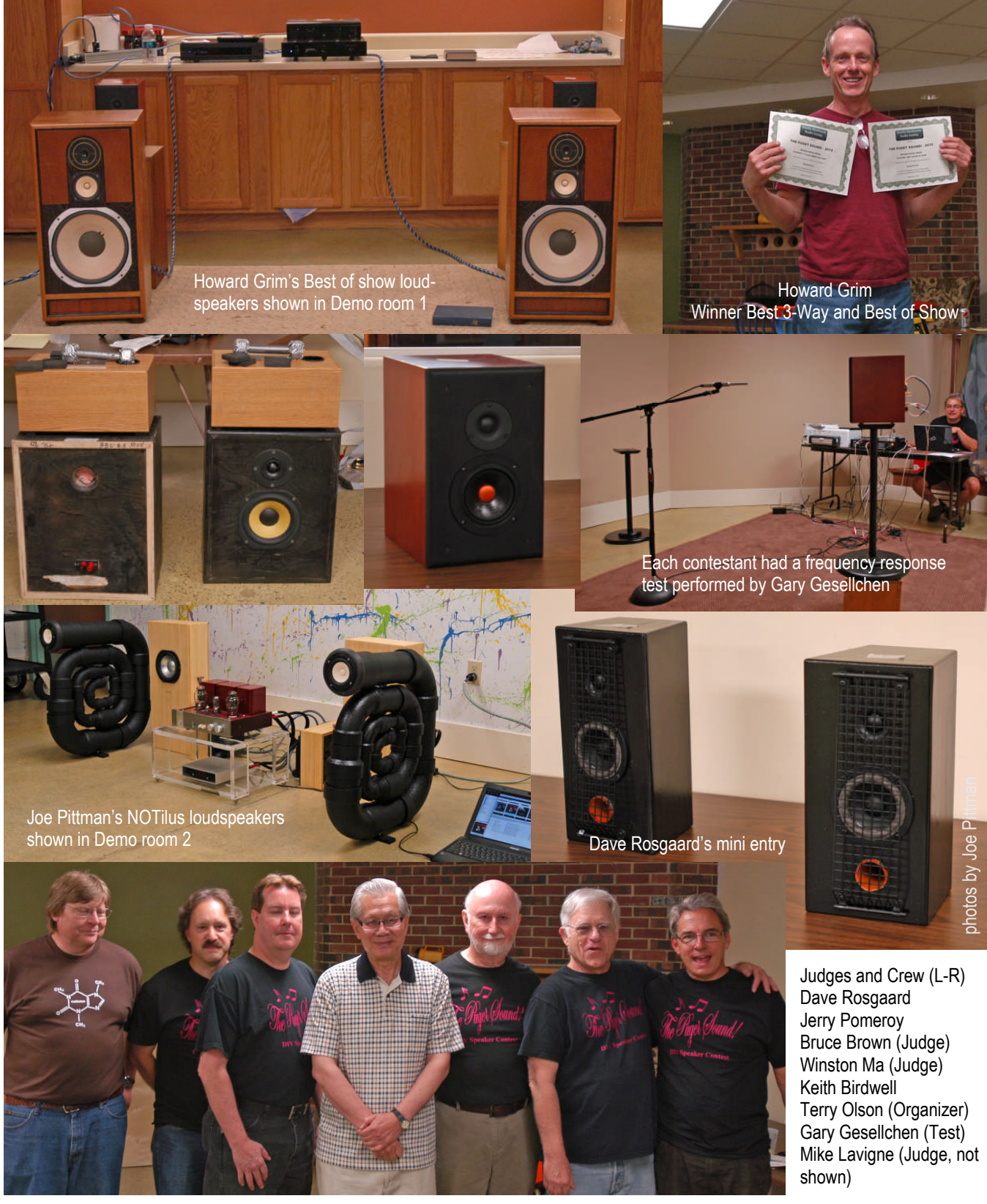
For more pictures and information, see <a href="http://www.audiokarma.org/forums/showthread.php?t=467561">http://www.audiokarma.org/forums/showthread.php?t=467561</a>