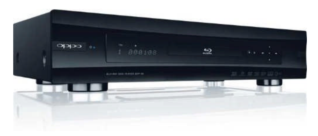
Oppo BDP-95 Blu-ray Disc Universal Player

Our October meeting will focus on amplifier topology. We will be pitting time-tested veteran Class A against the ambitious newcomer Class D. Both combatants are young and at the top of their games. For this bout, the Class A, Plinius SA-103, fresh out of a rave review in the April 2011 Stereophile, will go toe to toe with the Genesis GR360 Class D amp. The Genesis amp was the recipient of a Blue Moon award from 6Moons e-zine in June 2008. For this contest, you will be the judge.