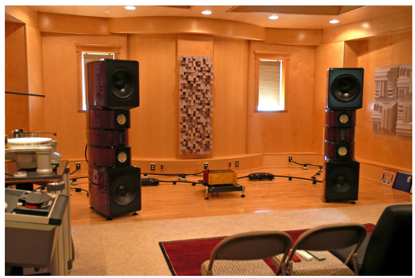
Playback Designs Digital, Evolution Acoustics MMThree Loudspeakers, DartZeel preamp and amp and Transparent Opus cables.