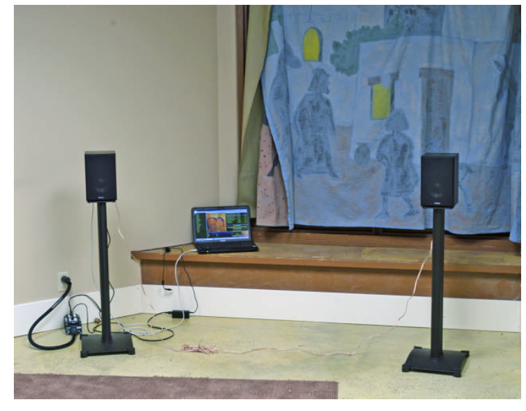
Vanatoo loudspeakers set-up in in a small room adjacent to the main room. The speakers were driven by Gary Koh's laptop into the Vanatoo's USB input.