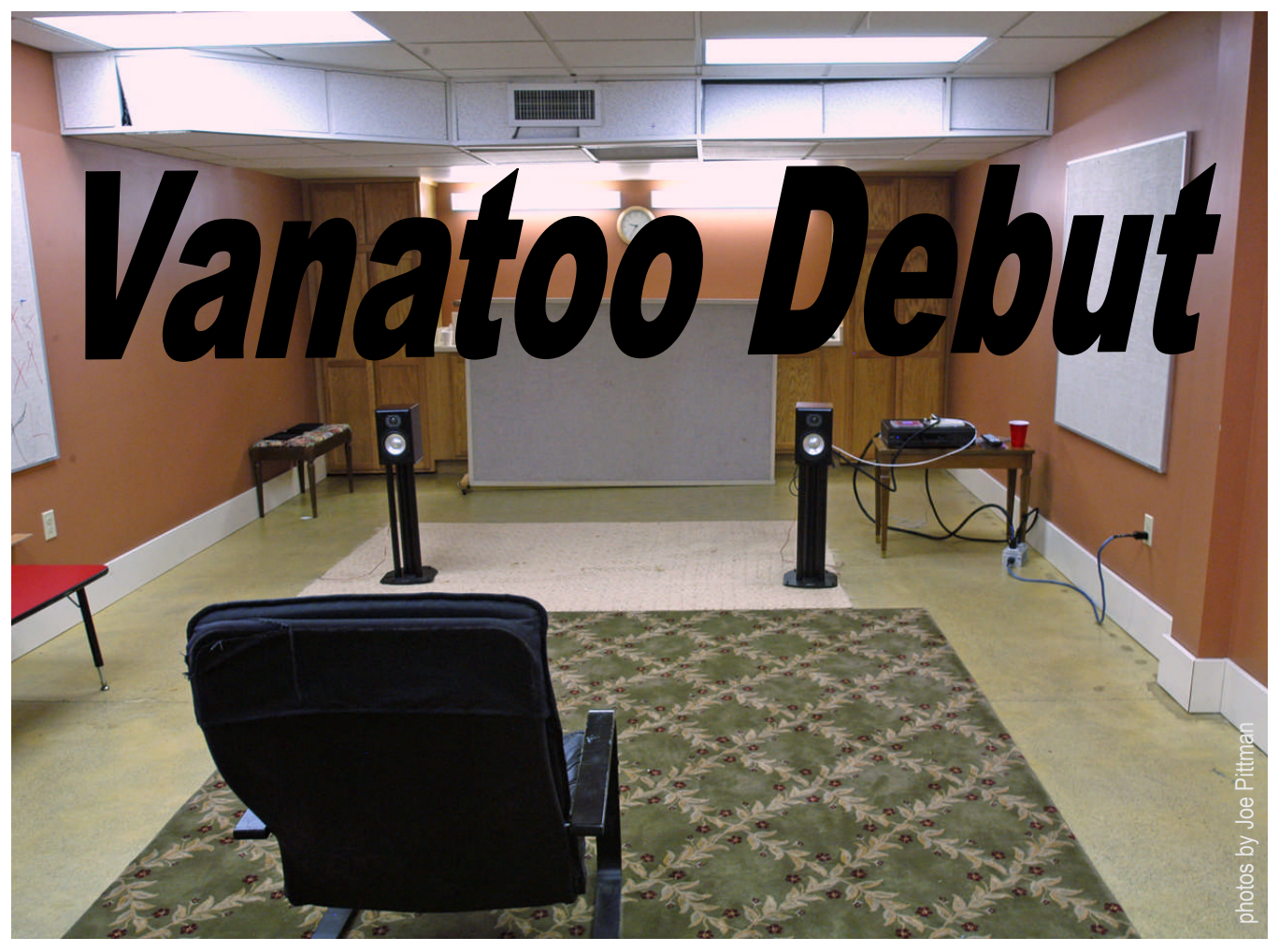
One of the 3 demo systems was playing in the small room adjacent to our main meeting room to give members an idea of what the Vanatoo loudspeakers sound like in a more appropriate room size. The speakers were driven by the club's Oppo BDP-95.