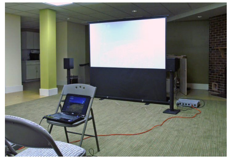
Vanatoo loudspeakers set-up in the main room. The speakers were driven by Rick Kernen's iTouch into an Airport plugged into the Vanatoo's power plug and connected with a mini-Toslink cable.

This is a versatile hi performing system. One exceptional application for this product would be Condo/apartment where the analog input could be used for a flat panel TV by using a digital Wi-Fi network such as Apple Airport you could access your music stored on iPod or iPad when you walk into the room. Wouldn't these make great computer monitors or second room system? Consider they cost only $500/black or $550/cherry, how can you pass this up.