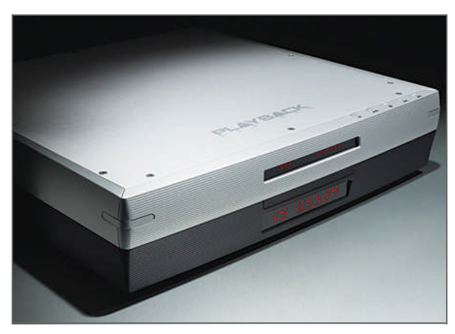
Playback Designs MPS-5