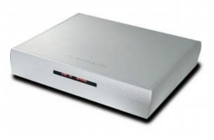
Playback Designs MPD-3