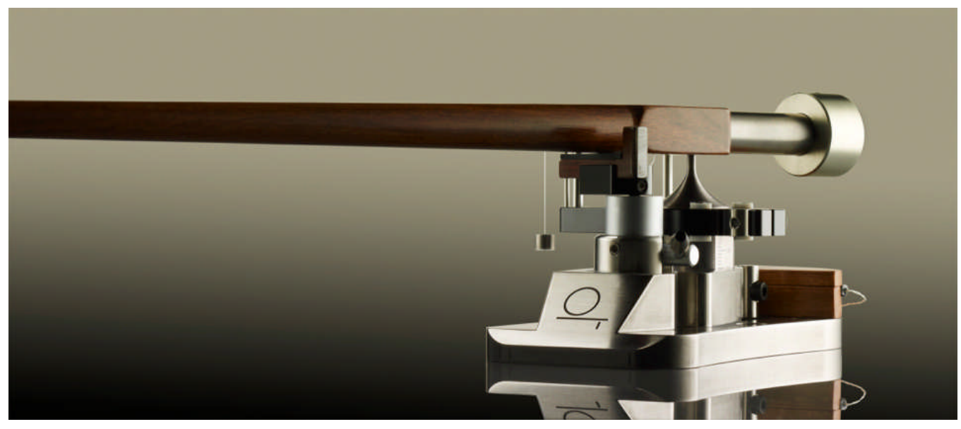
Durand Telos Tonearm

Phono Cartridge and Thoress phono preamplifier. System amplification will include Peigan Jiang's Plinius mono block amps.