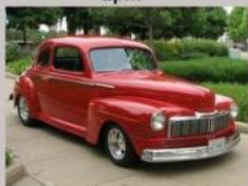
Tulocay 411 Coombsville Road, Napa