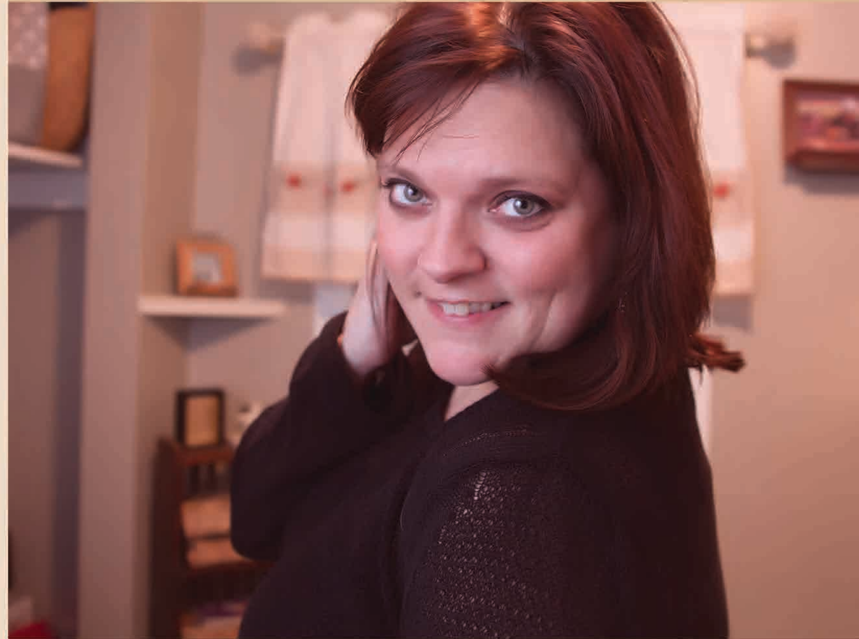
LYNN CAUDELL PHOTOGRAPHER OWNER, LYNN CAUDELL PHOTOGRAPHY, LLC

LET'S SCHEDULE A NO-PRESSURE CONSULTATION. YOU'LL BE GLAD YOU DID!