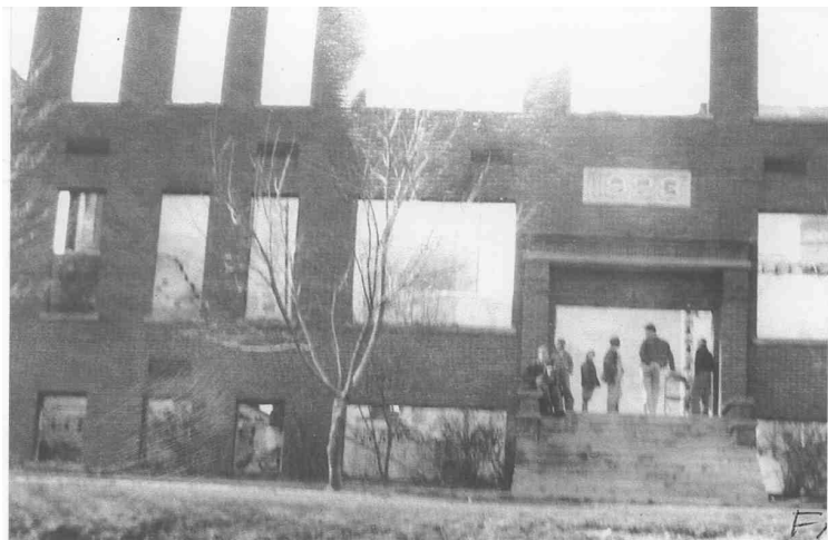
Milltown school fire - 1935