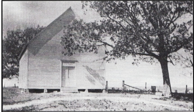
PLEASANT RIDGE CHURCH - NEAR MIFFLIN, INDIANA BUILT IN 1906 and TORN DOWN IN 1954.