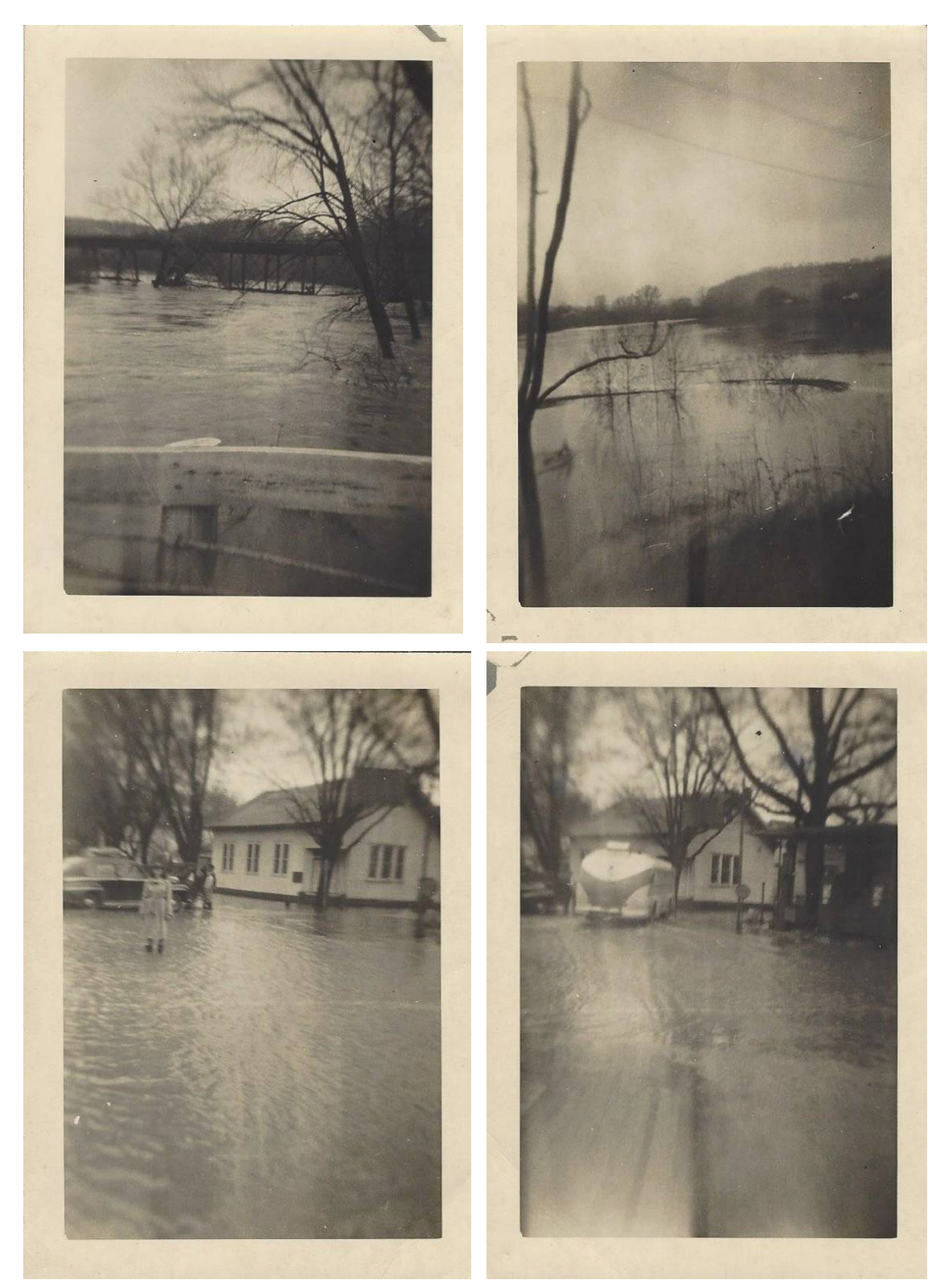
These photos are of the 1948 flood in Milltown, Indiana.