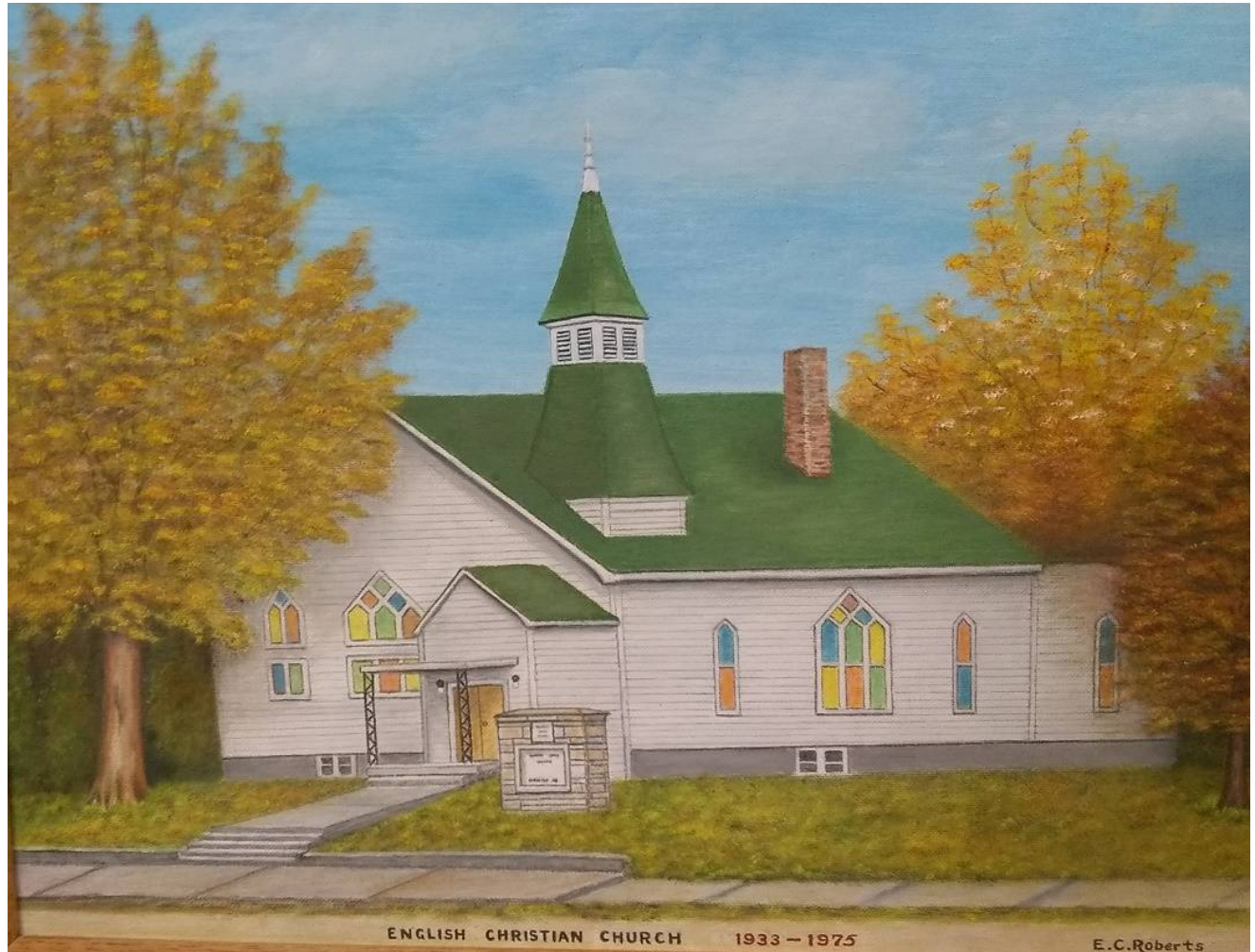
ENGLISH CHRISTIAN CHURCH 1933 - 1975