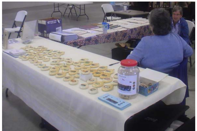
October 5, 2012, working the Fall Festival at the 4-H Fairgrounds. The next weekend we worked at the Sorghum Fest at the high school.