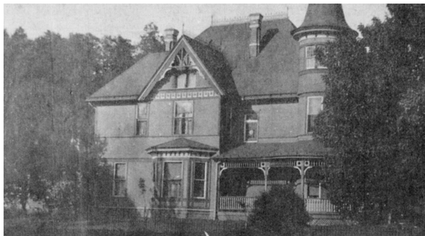
Suddarath House in English.